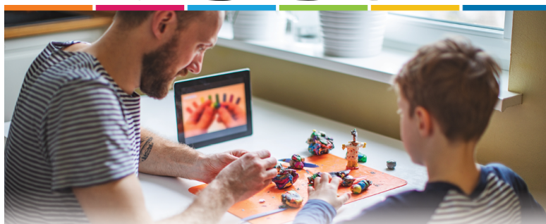
Arts & STEM Online Programming for Jewish Families: Perfect for Winter Break Fun!